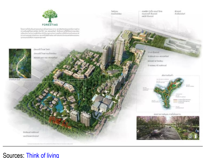
Exhibit 1: Forestias project

Exhibit 2: CPAXT announced an investment in the Happitat project